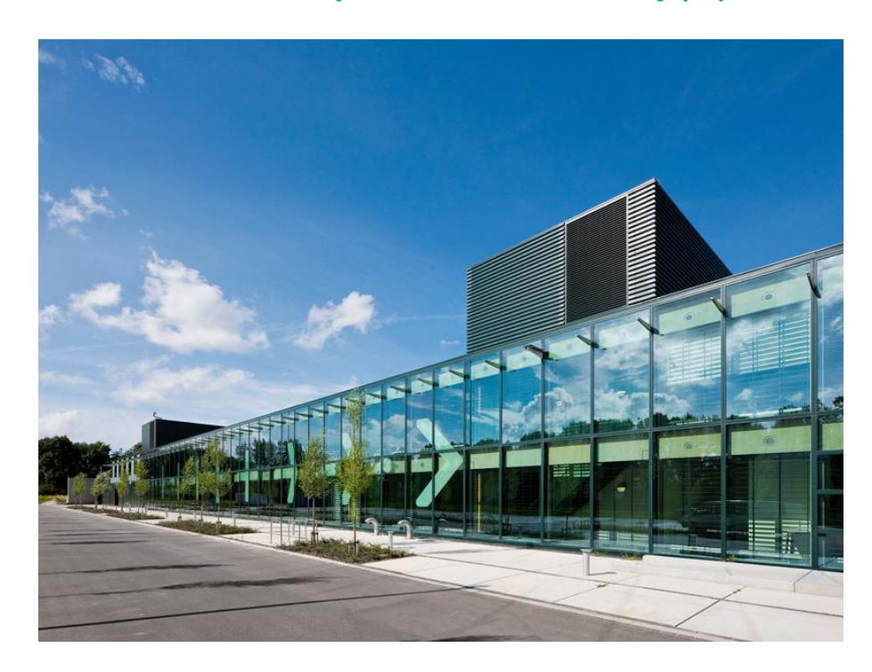
Green de Corp. Limited - Case-Study (33)